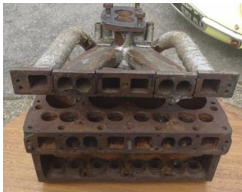
This is the original aluminium alloy block which with specially cast-iron modification was the first Lotus engine. The block was made from a cast iron block of the 1950s. It was the first Lotus engine to be built in the UK.