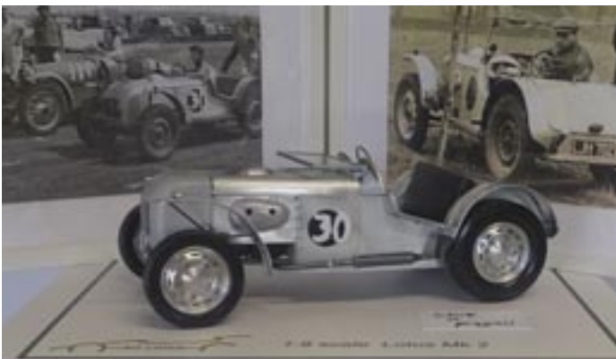
..... the first Lotus Circuit Racer, Silverstone June 3rd 1950, the Eight Clubs Race Meeting five lap scratch race, winner Colin Chapman , Lotus MK2.....